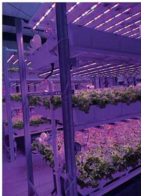
Figure 1. Lettuce grown inside the vertical farming facility at the University of Arizona.

A: Traditional LEDs are generally considered safe, however, certain high-energy wavelengths used for crop production can pose harm to humans.